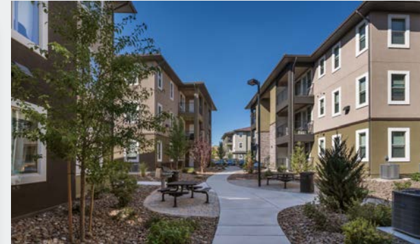
THE VINEYARDS APTS - 210 UNITS