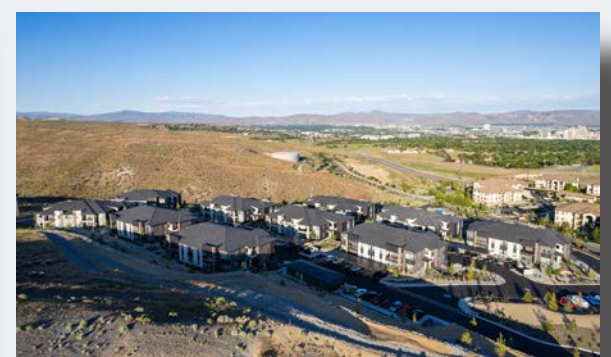
TRAILHEAD CONDOS - 115 UNITS