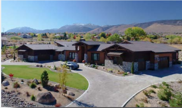
SOUTH RENO CUSTOM HOME DESIGNED & BUILT BY TANAMERA