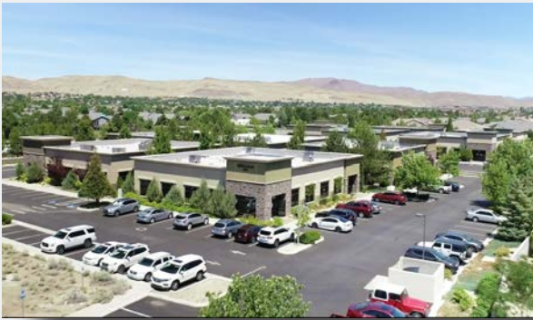
VINEYARD PROFESSIONAL CAMPUS - 87,000 SF OFFICE / MEDICAL