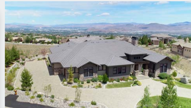
ARROWCREEK CUSTOM HOME DESIGNED / DEVELOPED & BUILT BY TANAMERA