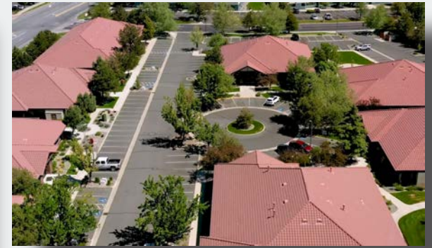
DOUBLE DIAMOND PROFESSIONAL - 120,000 SF OFFICE / MEDICAL