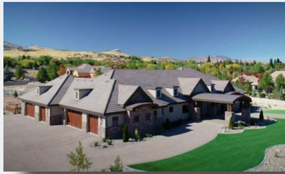
SOUTH RENO CUSTOM HOME DESIGNED & BUILT BY TANAMERA