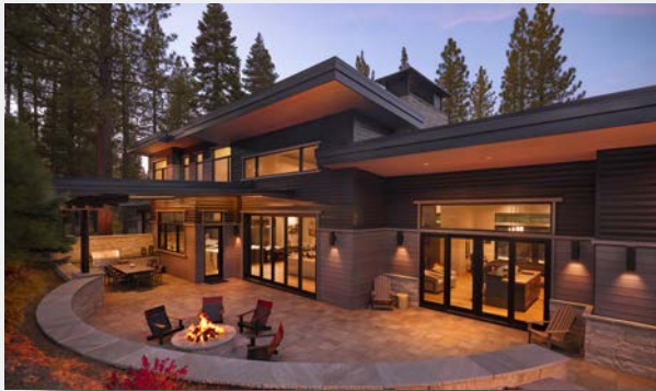
MARTIS CAMP CUSTOM HOME DESIGNED & BUILT BY TANAMERA