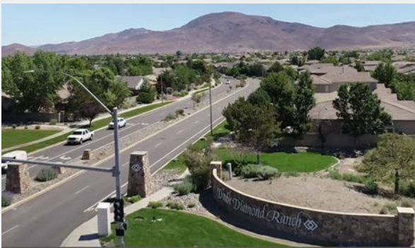
DOUBLE DIAMOND RANCH 3,000 HOME MASTER PLANNED COMMUNITY