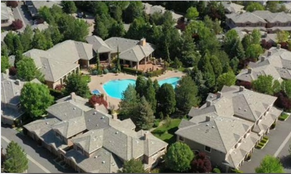
TANAMERA APTS - 440 UNITS