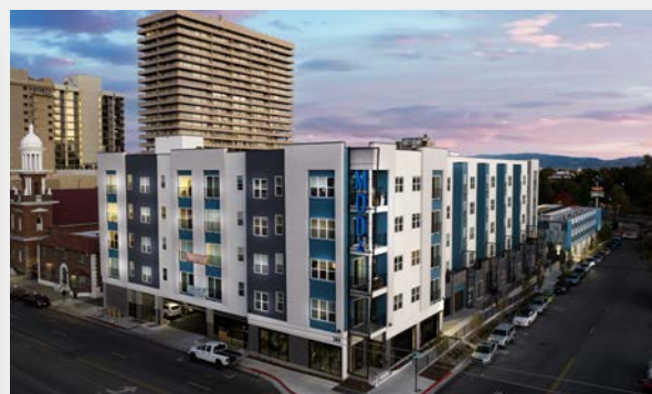
MOD 2 APTS - 69 UNITS