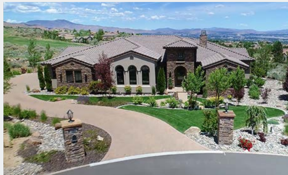
ARROWCREEK CUSTOM HOME DESIGNED / DEVELOPED & BUILT BY TANAMERA