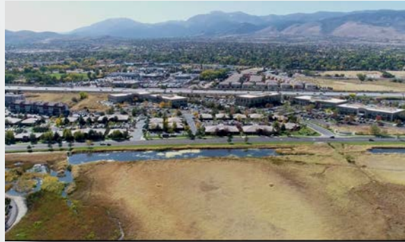
RENO TAHOE TECH CENTER - 512,997 SF OFFICE / MEDICAL