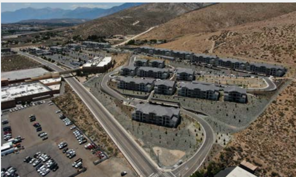
CARSON HILLS APTS - 370 UNITS