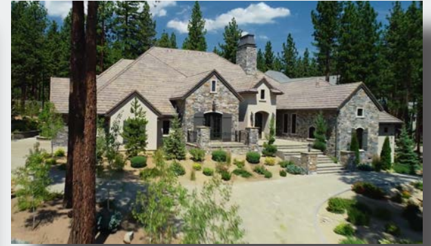
MONTREUX CUSTOM HOME DESIGNED / DEVELOPED & BUILT BY TANAMERA