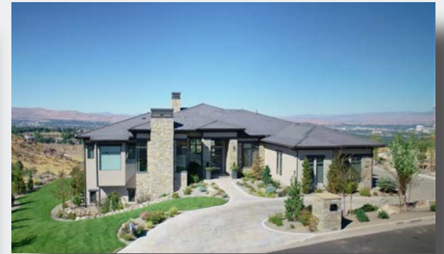
CAUGHLIN RANCH CUSTOM HOME DESIGNED & BUILT BY TANAMERA