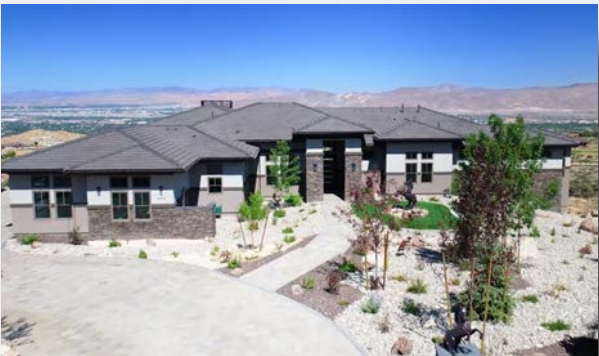
ARROWCREEK CUSTOM HOME DESIGNED / DEVELOPED & BUILT BY TANAMERA