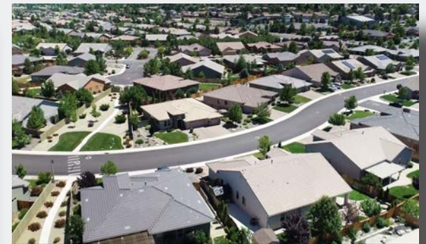
THE VINEYARDS - 307 HOME COMMUNITY