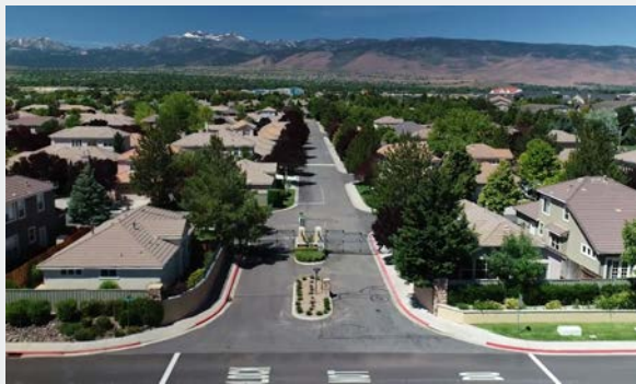
THE MEADOWS - 200 HOME COMMUNITY