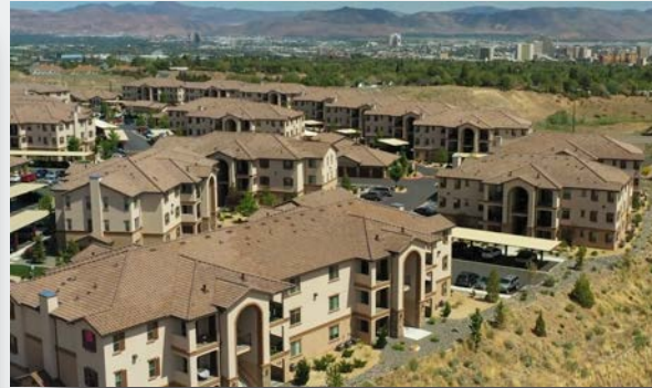
VILLAS @ KEYSTONE - 288 UNITS