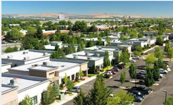
RENO CORPORATE CENTER - 430,000 SF OFFICE / MEDICAL