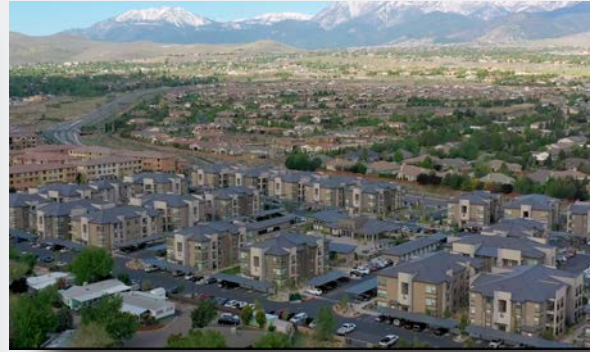
SIERRA VISTA APTS - 336 UNITS