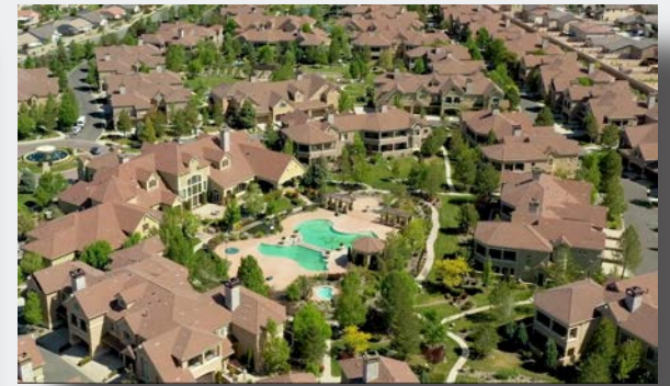
FLEUR DE LIS TOWNHOMES - 270 UNITS