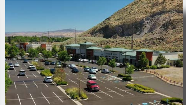
LONGLEY TOWN CENTRE - 100,000 SF RETAIL