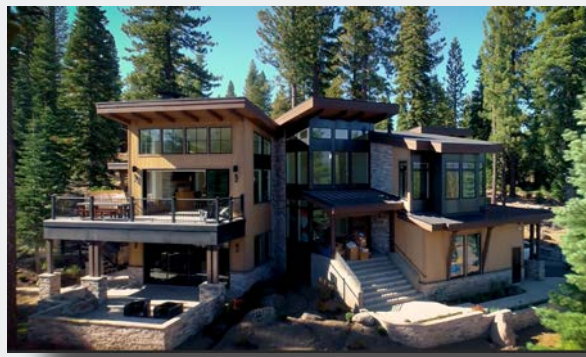
SCHAFFER'S MILL CUSTOM HOME DESIGNED & BUILT BY TANAMERA