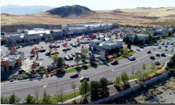
SPARKS GALLERIA - 473,043 SF RETAIL