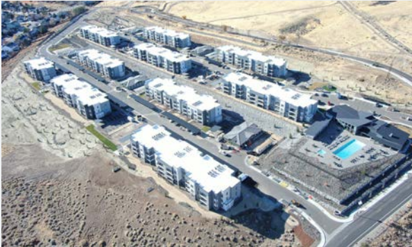
THE OVERLOOK APTS - 342 UNITS